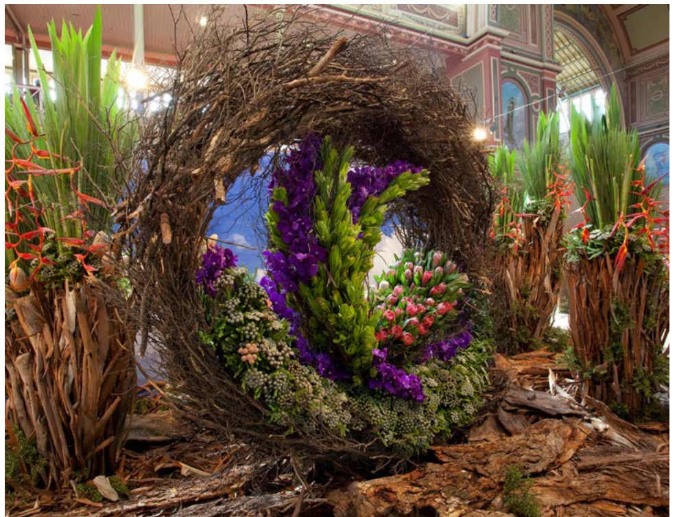
SMCT Exhibit at the Melbourne International Flower and Garden Show,

The display design is symbolic of the essence of the eight cemetery and memorial park locations for which SMCT is responsible, including the stunning botanical gardens of Springvale Botanical Cemetery and the Australian native landscapes of Bunurong Memorial Park in Dandenong South.