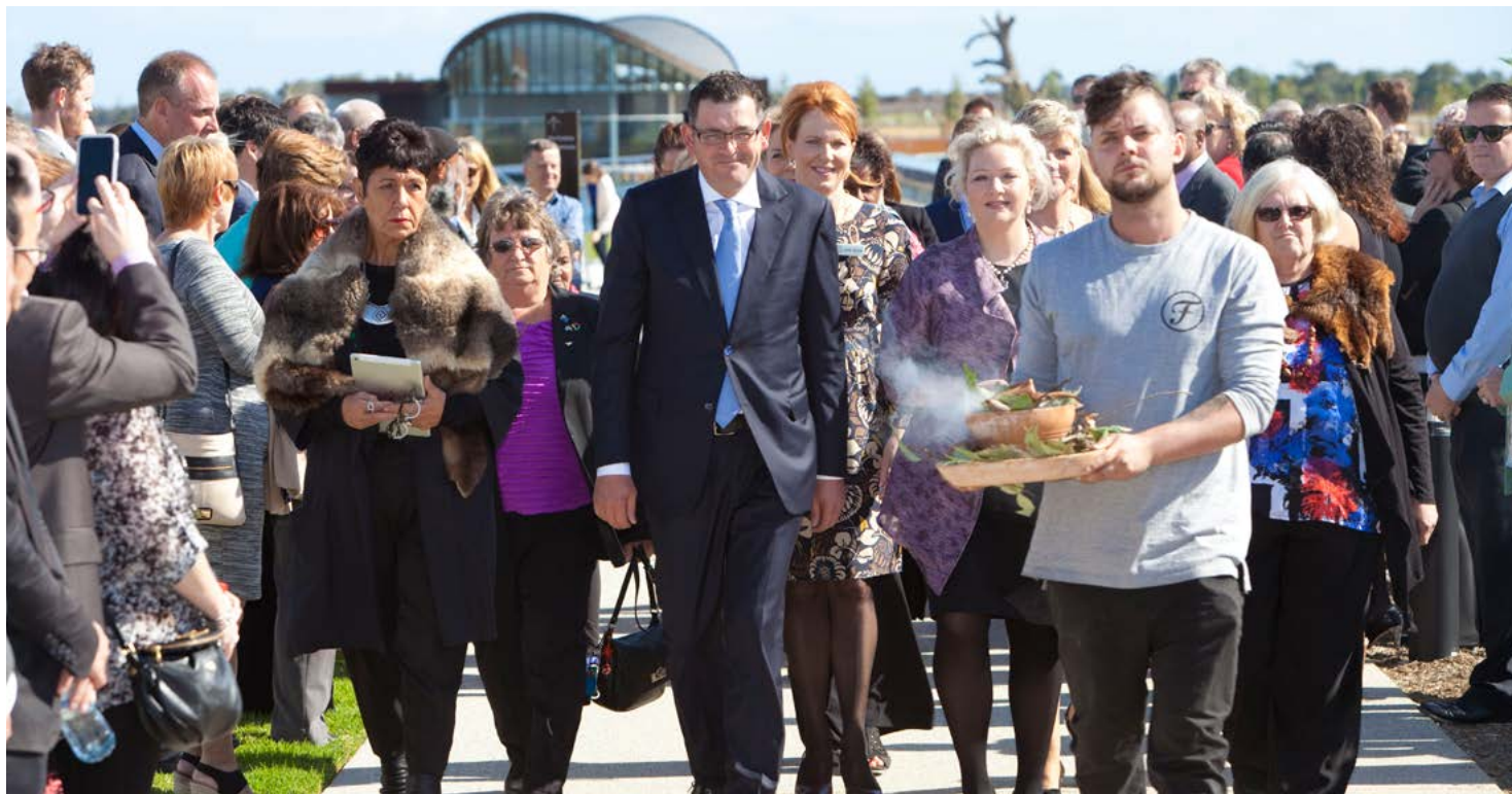
The smoking ceremony commences for the Official Opening of the Southern Aurora Centre at Bunurong Memorial Park