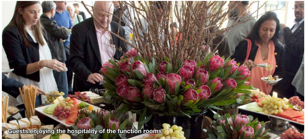
Guests enjoying the hospitality of the function rooms

The Hon Jill Hennessy MP, Minister for Health