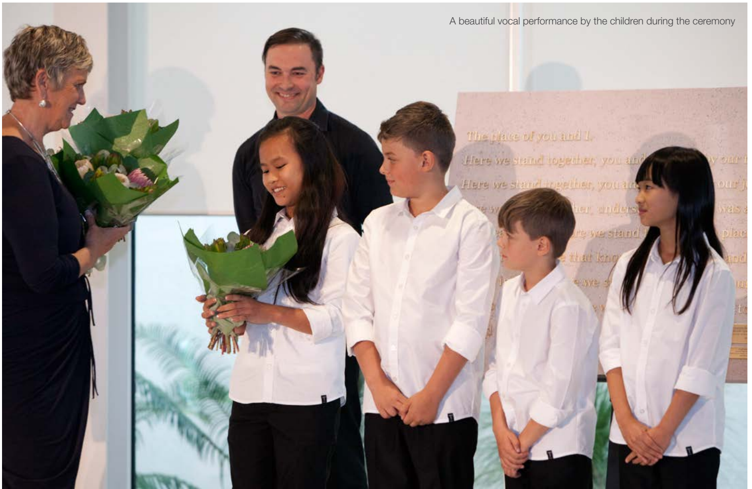
A beautiful vocal performance by the children during the ceremony

The Hon Daniel Andrews MP, Premier, addressing the audience during the official ceremony at the Opening of the Southern Aurora Centre.