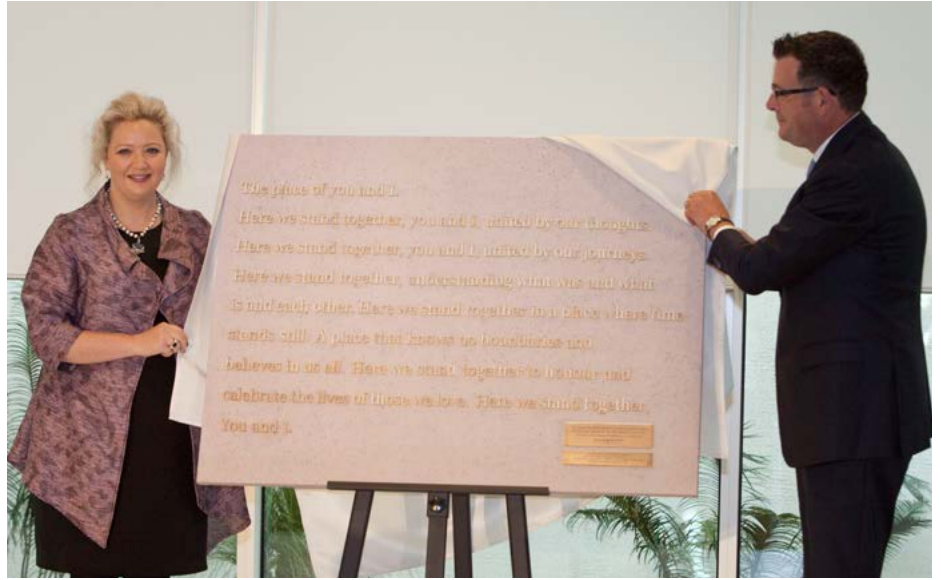
The Premier and Minister unveiling the plaque at the conclusion of the ceremony

Addressing the audience in the Cumulus Stratus Reflection Spaces, the Premier gave a resounding endorsement of SMCT's visionary development of Bunurong Memorial Park.